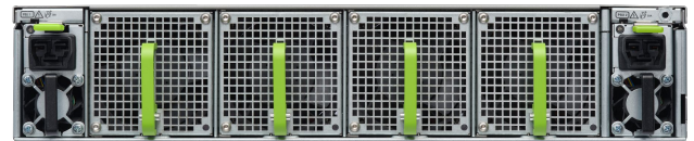
Front-to-Back Airflow 1+1 PSU and 3+1 Fans