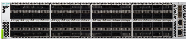
64 x 1600 GbE OSFP / 1 x 25 GbE SFP 102.4Tbps

A 16-core CPU complex allows for the most demanding control plane applications that are necessary for extremely large scale AI-factory environments.